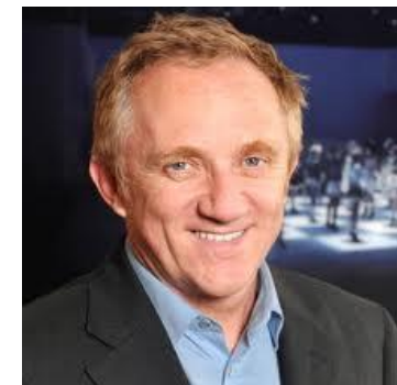
François Henri-Pinault Kering Group