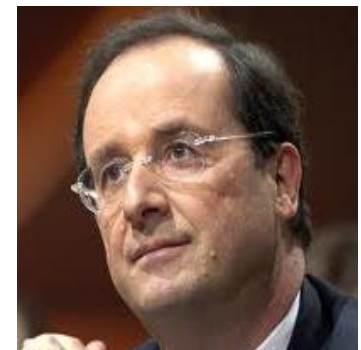
François Hollande France