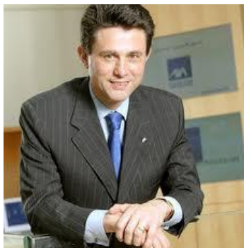
Henri de Castries AXA