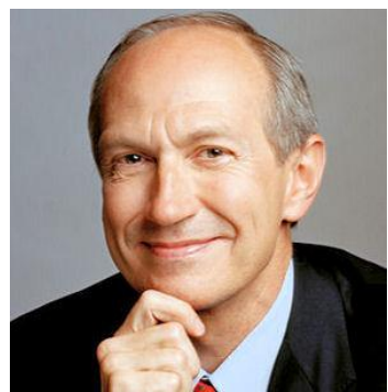
Jean-Paul Agon L'Oreal