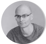
Pieter Abbeel Faculty Director, UC Berkeley

The Faculty Directors are subject matter experts who have expertly designed this course and will provide continuity throughout the course.