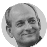
Stuart Russell Distinguished Professor UC Berkeley